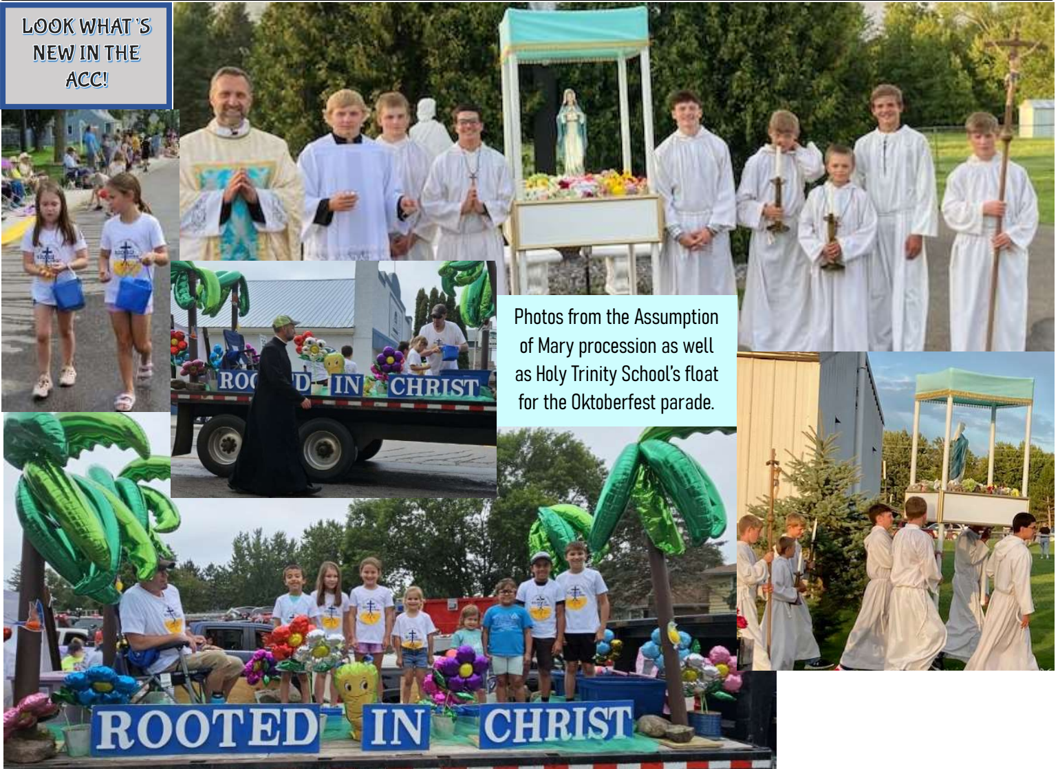
Photos from the Assumption of Mary procession as well as Holy Trinity School's float for the Oktoberfest parade.